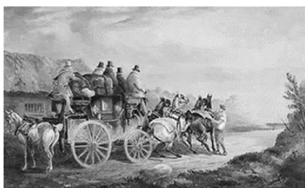
The Devonport mail: changing teams

know, only one of many who contributed significantly to its story. H.H.