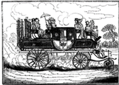
A steam driven 'road carriage'.

synonyms for speed with equivalents on other routes. But the Exeter Telegraph and the Devonport Quicksilver rivalry stayed in the public eye. They were countrywide bywords for their respective classes of vehicles. The Exeter Telegraph was one of the two best appointed coaches in the kingdom...it drew up for its exact one minute and a half to change horses at the 'George' 1 on its Exeter-bound journey through Ilminster. Ironically whilst Telegraphs were named for the era's fastest form of communication it was actually a prosaic semaphore messaging system using hilltops. The electric signalling system only arrived in 1838. By the time it was pulled from service in the wake of the Great Western Railway c1848 The Exeter Telegraph's journey time was down to 14 hours. It could all have been so different because as Mrs Nelson was pouring money into horse drawn traffic on The New Direct Line in London, so Ilminster's Lord of the Manor, William Hanning was exploring an entirely new future for the same route. Hanning was fascinated by steam driven road vehicles becoming a director in 1826 of 'The Gurney Steam Carriage Company'